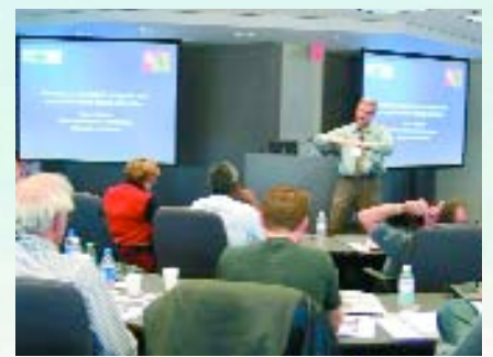
DoodleTrain course in session.

The third project was cooperating with the CAGC on the "Seismic-in-motion" seismic field trip in October. This project, aimed at introducing office-bound oil patch staff, clients and regulators to modern seismic acquisition methods and equipment in a field setting was a huge success. One hundred fifty people attended each day. The weather was great and a third day had to be added to accommodate the demand. The Seismic-in-motion field trip was a tangible benefit to our members and we thank the CAGC for putting