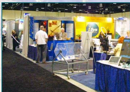
View of exhibits floor at the 2005 CSEG Convention.

The 2005 CSEG National Convention was once again held in Calgary from May 16th to May 19th but in a new venue, the Roundup Center at the Calgary Stampede. We would like to thank all those who submitted papers and posters to make the technical sessions a success. Their hard work was greatly appreciated. We also had a full exhibit hall due to the continued support of the CSEG exhibitors and the addition of the CAPL Prospect Exchange.