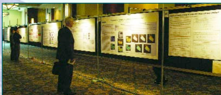
Poster session at the 2005 CSEG Convention.