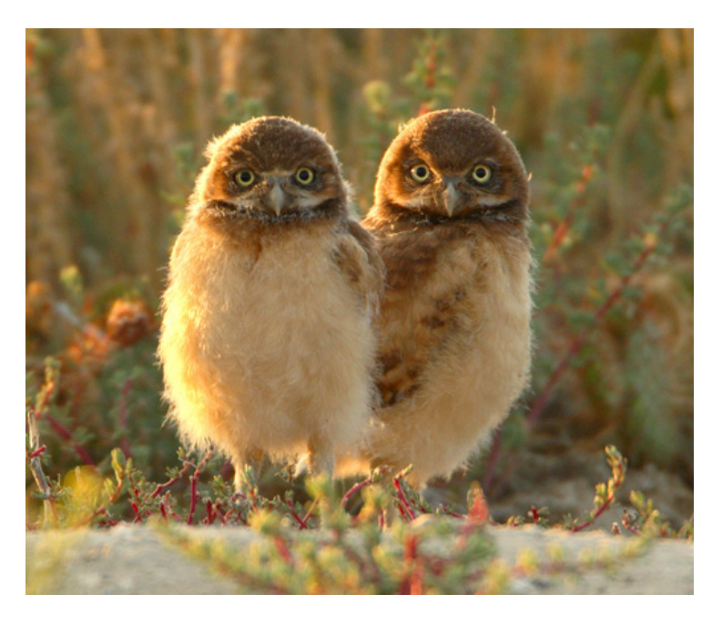
Figure2: Young Burrowing Owls

This species is identified as " Threatened " in the Alberta Wildlife Act and is considered " At Risk " within the Province. (Figure 2)