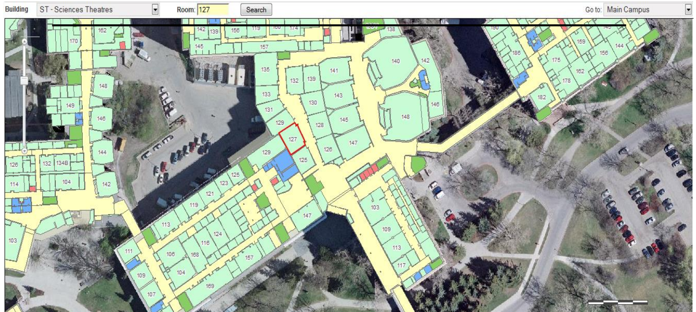
Map Location: ST127 shown above